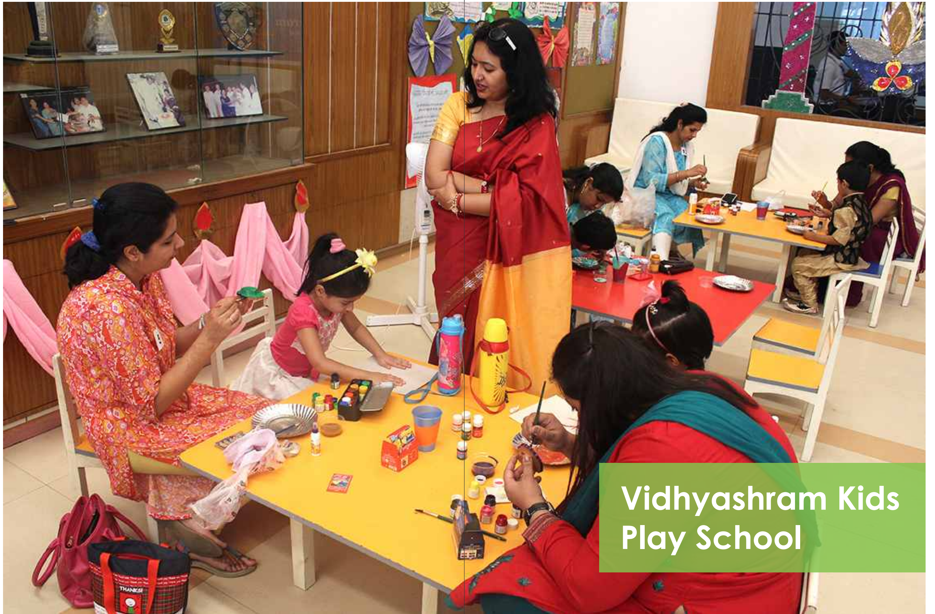
Vidhyashram Kids Play School