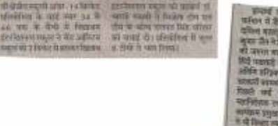
विद्याश्रम इंटरनेशनल स्कूल ने अंडर-19 स्कूली क्रिकेट प्रतियोगिता में जीता खिताब प्राप्त किया।

जोधपुर। विद्याश्रम इंटरनेशनल स्कूल ने अंडर-19 स्कूली क्रिकेट प्रतियोगिता में जीता खिताब प्राप्त किया। प्रतियोगिता में 28 व 29 सितंबर को आयोजित कराई गई थी। विजेता स्कूल को प्रथम स्थान पर रखा गया।