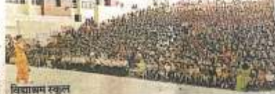
विद्याश्रम स्कूल में गुरु वंदना कार्यक्रम आयोजित किया गया।

जोधपुर। भारत के पूर्व राष्ट्रीय अध्यक्ष डॉ. सर्वपल्ली राधाकृष्णन के जन्म दिवस के अवसर पर विद्याश्रम स्कूल में गुरु वंदना कार्यक्रम आयोजित किया गया।