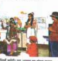
विज्ञान नाटक उत्सव प्रतियोगिता में विद्याश्रम इंटरनेशनल स्कूल टीम ने जीता खिताब प्राप्त किया।

जोधपुर। विद्याश्रम इंटरनेशनल स्कूल टीम ने विज्ञान नाटक उत्सव प्रतियोगिता में जीता खिताब प्राप्त किया। प्रतियोगिता में 28 व 29 सितंबर को आयोजित कराई गई थी। विजेता स्कूल को प्रथम स्थान पर रखा गया।