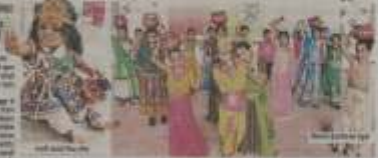
शिक्षण संस्थानों में कृष्णा जन्माष्टमी की धूम मचाई गई।

शिक्षण संस्थानों में कृष्णा जन्माष्टमी की धूम